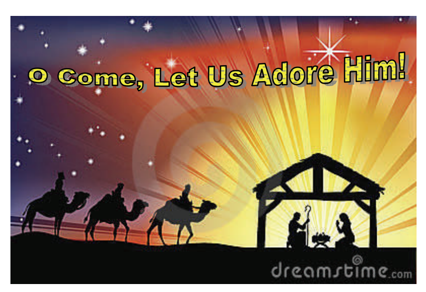
A Blessed Christmas to All!